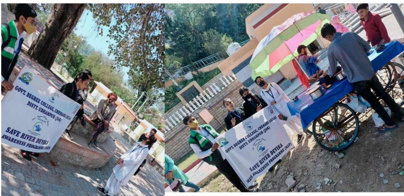
The Students educating the general public in the temple premise & the street vendors /hawkers