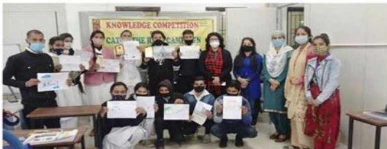
Students displaying painting during a programme on preservation of water organized by GDC Chenani.

The students of the college enthusiastically took part in the painting competition on the theme "Catch the Rain" with the tagline "Catch the rain, where it falls, when it falls". They expressed their ideas through beautiful paintings, sketches, drawings re-